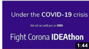
Tribute to the participants